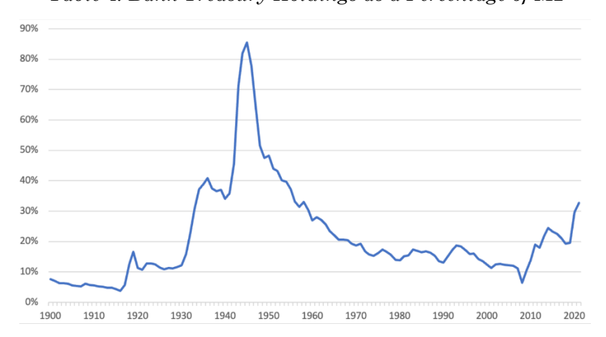
Table 4: Bank Treasury Holdings as a Percentage of M2130

At its June 1950 meeting, the FOMC was increasingly focused on the "rises in price of an unexpected and most alarming character." Concerns over the Fed's limited ability to simultaneously tighten monetary policy and maintain stability in long-term interest rates kicked off a