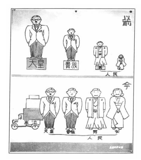
Emperor, aristocracy, men, women: then and now

However dubious the impact of these early propaganda efforts, over time the Peace Constitution [heiwa kenpō], as it was often called, became embedded in the popular mind, even if vaguely and without "a burning desire to revise it."44 By 1967, twenty years after it went into effect, 64% knew something about the content of the constitution (popular sovereignty, pacifism, human rights). Forty-three percent said the constitution had not been imposed on Japan (compared to 31% in 1956). Of the two-thirds with some knowledge of the constitution, 49% said it did not much matter if it was based on the occupation draft and 75% thought its objective was peace. Only 40% of those polled had read the document, but 56% thought that it was in sum a good constitution.45