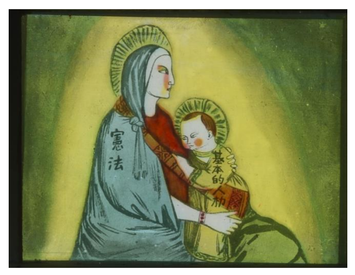
Granted something precious: the "constitution" holds "basic human rights"

The Association distributed twenty million copies of its 1947 book, Atarashii kenpō akarui seikatsu [New constitution, bright life], which included "then" and "now" diagrams of the change in the political system, with the people ruled from above (then) and the people electing the Diet (now).42