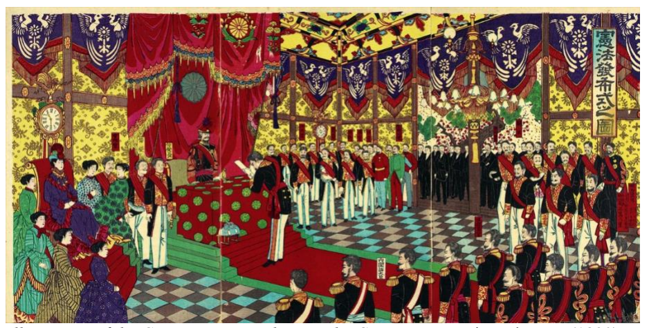
Illustration of the Ceremony Promulgating the Constitution, artist unknown (1890)19

Few understood the meaning of the festivities: one man expected that the celebration of the promulgation would, like other holidays, be repeated annually; others copied the text on scrolls and hung them high on the walls of their houses. Yet some two decades later, when the Meiji era ended in 1912, nearly everyone knew the word and many gave credence to the importance of the constitution. The now established political parties each had the word "constitutional" (rikken) in their names and were quick to hurl the epithet "unconstitutional" at the actions of the government. Students labeled their teachers "unconstitutional" when they overrode school rules, and geisha used the same insult about customers who did not pay what they owed.20 The first of two political movements "to protect constitutional government" (kensei yōgo) occurred in 1912, and by the 1920s, its foreign models no longer relevant, it was simply the Constitution of the Empire of Japan. Although it remained a gift from the emperor, by then many more claimed its authority and felt empowered to speak in its name.