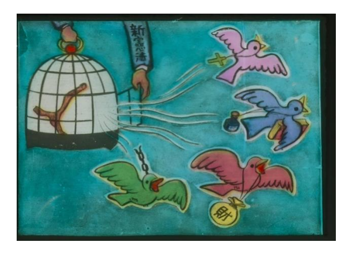
New human rights take wing under the "new constitution"