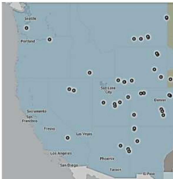
Figure 3. Coal Plants in the Western Electric Coordinating Council, Source: U.S. Energy Information Administration (Mar. 2021)

Resource shuffling poses an especially large challenge for cutting power sector emissions in the West because, as shown in Figure 3, the states most likely to be first-adopters of linkable CAT programs—California, Oregon, and Washington 192 —have little coal-fired