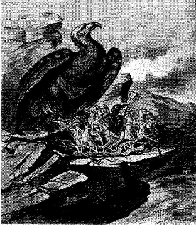
The Carrion Crow in The Eagle's Nest, Puck, Jan. 25, 1882

The cartoon depicts a fierce eagle, stars and stripes on its wings representing the United States, protecting its nest, which is labeled "union." Inside the nest are eaglets, all White, each labeled for a state. A "carrion crow" labeled "Utah" rises up in their midst, clutching a bone labeled "Mormonism." Three things bear mentioning. First, the cartoon appeared less than a generation after the end of the Civil War, when most viewers would situate its imagery within the national catastrophe of Confederate Secession. Second, it labeled the bird representing Utah as "Carrion Crow." This crow gets its name from its habit of eating dead animals, making its presence in the caption depict Mormonism as a harbinger of death. Moreover, the birds representing the other states seem to be eaglets, the same species as the eagle, while the crow represents a new species, black, holding its own bone and defiantly turning its back on the mother. In contrast, the eaglets either beg for food or look out as if guarding the nest.