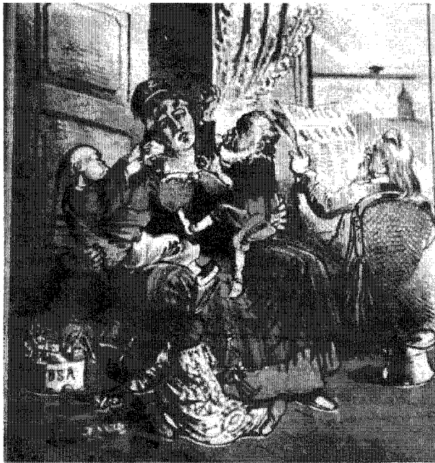
The Three Troublesome Children, THE WASP, Dec. 16, 1881

Like Uncle Sam's "troublesome bedfellows," discussed earlier, 136 this cartoon deploys a domestic scene to argue for limiting pluralism in the growing nation. But where Uncle Sam was booting Mormon and Chinese "problems" out of bed in "Uncle Sam's Troublesome Bedfellows," 137 here he is inactive. He languidly reads a newspaper labeled "Politics," dollar signs in the place of headlines suggesting concern with commerce rather than the more immediate matters demanding attention in the cartoon's foreground. There, three "troublesome children" harass a beleaguered Columbia. On one knee a Chinese child pulls Columbia's hair like the Native American poking a finger in Uncle Sam's ear in the "Troublesome Bedfellows" cartoon. 138 On the other knee a simian polygamist batters her with a pipe, and at her feet a Native American child sits, clubbing lead U.S. soldiers with a tomahawk. The blanket draped across Uncle Sam's wicker chair, labeled "Law," suggests the (unused) remedy for this abuse: more statutes and more prosecutions.