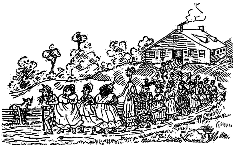
A Mormon Family out for a Walk , THE COMIC HISTORY OF THE UNITED STATES (1870)

Effeminacy, frightening numerous women and children, and racial and national diversity of those wives and children seem like code for the danger of racial degeneration and collective disorder through polygamy. For example, an 1870 cartoon titled “A Mormon Family out for a Walk” features one wizened, weak man leading four or five wives of various races and nationalities. 129