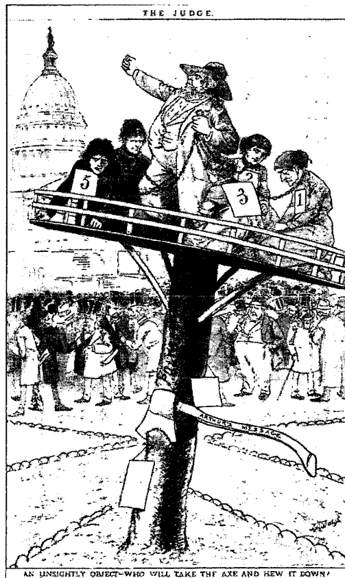
An unsightly object—who will take the axe and hew it down? THE JUDGE, Jan. 28, 1882

Similarly, an 1882 cartoon in The Judge , titled "An Unsightly Object," 253 mined the common view of polygamy and slavery as the "twin relics of barbarism" by depicting polygamy like a slave auction in which beleaguered White women wore numbers as if they were chattel for sale.