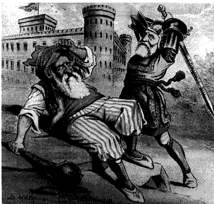
Hit 'em Again, THE JUDGE, 1885

Nineteenth century viewers could hardly be surprised to see the Mormon Question played out as a battle, given the Mormon War. The battle lasted a full fifty years in large part because, unlike the cringing Turk, the Mormons fought back, often using the very same tools aimed against them.