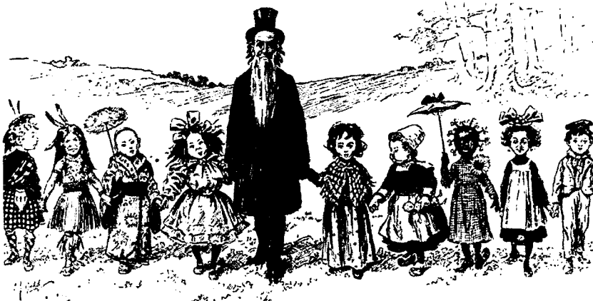
Mormon Elder-berry—Out with His Six-Year-Olds, Who Take After Their Mothers, LIFE, Apr. 28, 1904

Mormons still practiced polygamy, the joke still had traction. A 1904 cartoon titled “Mormon Elder-berry—Out with His Six Year-Olds, Who Take after Their Mothers,” published in Life Magazine , ridicules Mormon fecundity as well as racial and national diversity. 130