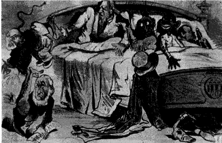
Uncle Sam's Troublesome Bedfellows, THE WASP, Feb. 8, 1879

Uncle Sam, representing the country, shares a big bed with three “troublesome bedfellows,” and is in the process of kicking out two others. Lumping Mormon, Chinese, Native American, Black, and Irish figures as “troublesome bedfellows” served two purposes. First, it suggested a common debasement of all five groups. Second, it distinguished all of them from Uncle Sam. Edward Said explains, in the colonial context, how designating people or groups as “problems” rather than human beings determined their defeat from the outset: