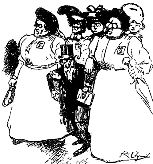
There are Influences Greater than the Government in Utah, NEW YORK WORLD, 1904

The cartoon may well have meant to depict polygamy as an institution so strong it could overpower the state ban on it. Additionally suggested are the dangers posed by powerful women seeking public rights. Utah had granted women the vote in 1870, before Congress disenfranchised Utah women through the Edmunds Tucker Act in 1887. 261 An 1899 article in the Afro-American charged feminists, proponents of free-love, and polygamists with waging war “against the marriage institution.” 262 By 1904, Utah women had been voting for a decade, by virtue of new state’s constitution, which had restored female suffrage. 263 New York, presumably home to most readers of the New York World , was much more hostile to women voting than Utah, withholding suffrage from women until 1917. 264