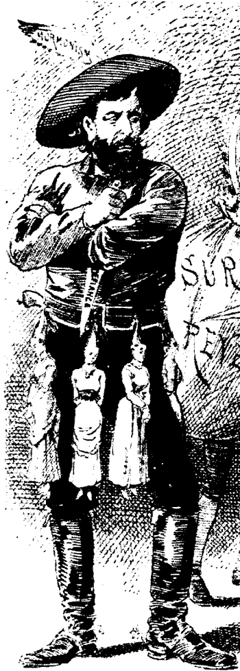
Defiance, THE DAILY GRAPHIC, early 1880's

Yet more is going on in the cartoon. In addition to conveying the disorder of too much male power, the feather in his cap labeled “Mormonism” may signal Native American resistance to Federal incursion, 251 as well as Mormon propensities to savagery and even murder. 252 This theme of