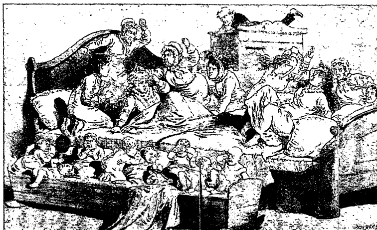
The Elders' Happy Home , CHIC, Apr. 19, 1881

domestic scenes decrying polygamy's political and domestic disorder, as well as the federal government's inability to end the practice. "The Elder's Happy Home," published in April of 1881, presents the familiar scene of a sidelined patriarch overwhelmed by his many wives and children: 133