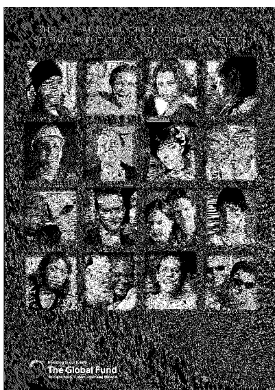
Figure One: The Two Covers of the Global Fund Gender Strategy 19

By examining the Gender Strategy, I set the stage for the historical inquiry that follows: How did the identity/risk narratives come to exist the way we see them today? How did narratives of risk and vulnerability in the context of gender become irreconcilable such that women/men and “sexual minorities” could not be discussed or understood in one gender strategy?