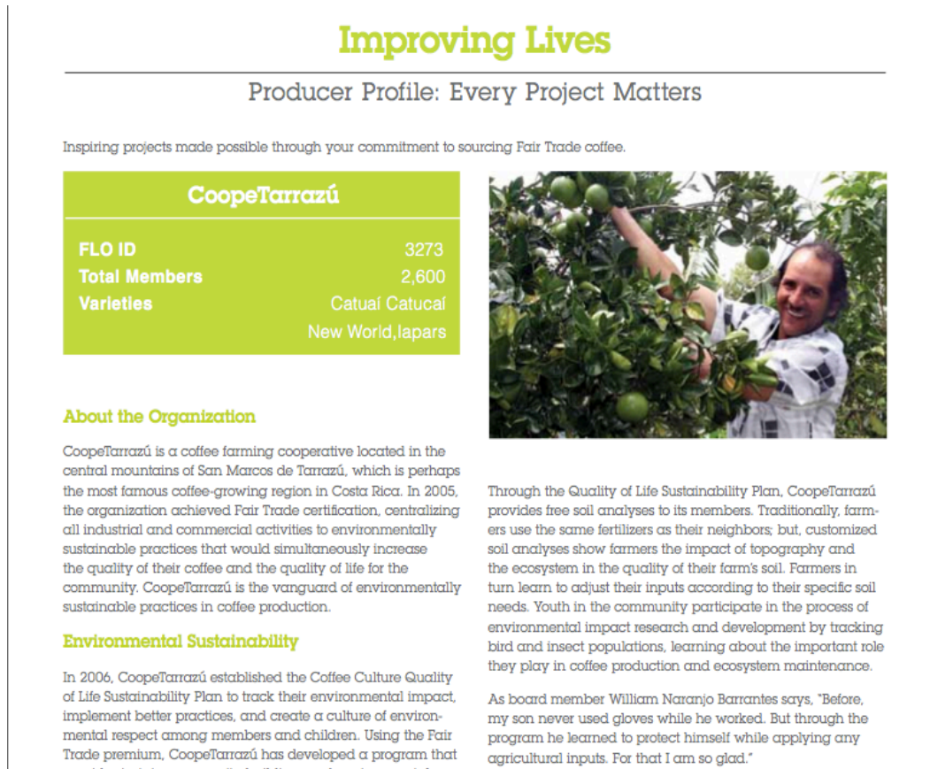
Figure 1: “Fair Trade: Importing Lives Producer Profile” FairTrade USA, 2012 < http://fairtradeusa.org/what-is-fair-trade/impact >

Along the same vein of the biblical, Garden of Eden portrayal of tropical forests in developing countries, in his book “Uncommon Ground: Rethinking the Human Place in Nature”, environmental historian William Cronon explores humanity’s schizoid relationship with nature, a topic that has been exacerbated by green marketing and alternative consumption. This theory states that wilderness has been elevated to a spiritual experience that consumers feel frees them from the mundane confines of human civilization and traditional societal roles. This viewpoint can be problematic in how Northern consumers view the natural resources of developing countries, and therefore through alternative consumption, these viewpoints can directly shape the agendas of NGOs or the specifications for the certification processes for eco-labeling. For example, when the rainforest is portrayed as an untouched, pristine landscape, consumers in the Global North tend to overlook the need to support the indigenous peoples who call the rainforest home. This in turn can create an apathy towards the plight of indigenous tribes or smallholder farmers, who can be viewed as “outsiders” to the forest ecosystem. In other words, because of Edenization, consumers from the Global North are less sympathetic to farmers and smallholders that are cultivating small parts of the rainforest for sustenance because they are not viewed within the idealized, “trees, animals, and nature” rainforest landscape.