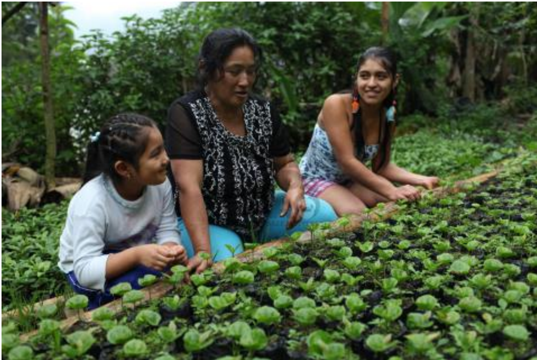
Figure 2: James Rodriguez for Fair Trade USA, “Gender Equality Supported by Fair Trade”, Fair Trade USA, 2013, < https://photos.fairtradeusa.org/preview/391 >

a natural setting, thus weaning perceptions away from untouched wilderness and bringing social turmoil and class conflict into the forefront of the Western consciousness. However, in its approach for community-based funding that gives premiums to co-operative farmers, Fair Trade continues to ignore the existing class issues that are perpetuated by government corruption and the exploitative, wealthy elite. In this way, Fair Trade serves as more of a Band-Aid, albeit a relatively successful Band-Aid, instead of a cure. In its own way, Fair Trade exemplifies the Edenization of developing countries, implying that hard-working small farmers are inhibited only by their meager wages through the exploitation of labor by large, multi-national agribusiness corporations, and fails to address the system of institutionalized oppression and both geographic and socioeconomic discrimination by the arguably corrupt governments of the developing countries. In this way, Fair Trade certification smartly avoids becoming a politicized matter, and it is still important to note the successes of improving the quality of life for farmers on a more localized, case-by-case level.