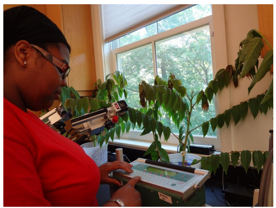
Image 3. Photosynthetic measurements were made using the Licor<sup>®</sup> 6400.