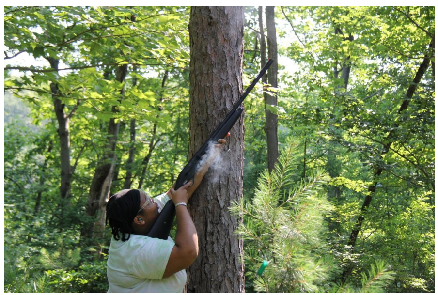
Image 1. The shotgun method is employed to retrieve canopy tree branches.

Table 1. Temperate tree species that naturally occur at the BlackRock Forest, Cornwall, NY. Species ranges categorized by thenative ranges specified in the USDA Forest Service Sylvics Manuals(http://www.na.fs.fed.us).