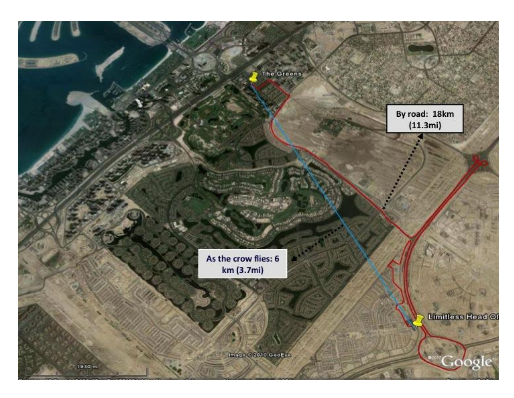
Figure 3: The lack of places to turn left tripled the distance of my evening commute home. The morning commute was 1/3 as long, because of more opportunities to turn right. With a grid many times coarser than Manhattan, everyone lives, works and shops on large islands surrounded by a ring of asphalt and sea of sand. Although this Google photo depicts a largely low-rise area, there are in fact a number of 40-70 story buildings along the Gulf's edge in Dubai Marina.

And then there's the superhighway supergrid, the American model on hormones, not unlike Robert Moses' realized and unrealized dreams in New York City. With up to six or even seven lanes in either direction and the world's largest and most baroque interchanges, it can be hair-raising to drive and hair-pulling to navigate. If you miss your exit, you might well miss your meeting. It can take 15 - 30minutes to recover, and that's only if you have a co-pilot or GPS; and neither map nor electronics can quite keep up with the changing roads and construction detours.