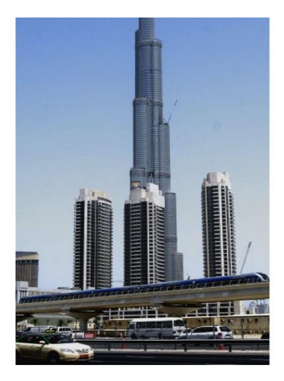
Figure 6: Cars, taxis, vans, buses, trucks and Metro stream and sometimes scream by the world's tallest building, which stands higher than the Empire State and Chrysler Buildings stacked one atop the other.

transportation heroes of Dubai. There is no subaltern transportation mode of this size or complexity in Manhattan, which has a far smaller proportion of underclass, non-native residents and international workers and servants (who are not eligible for citizenship in Dubai).