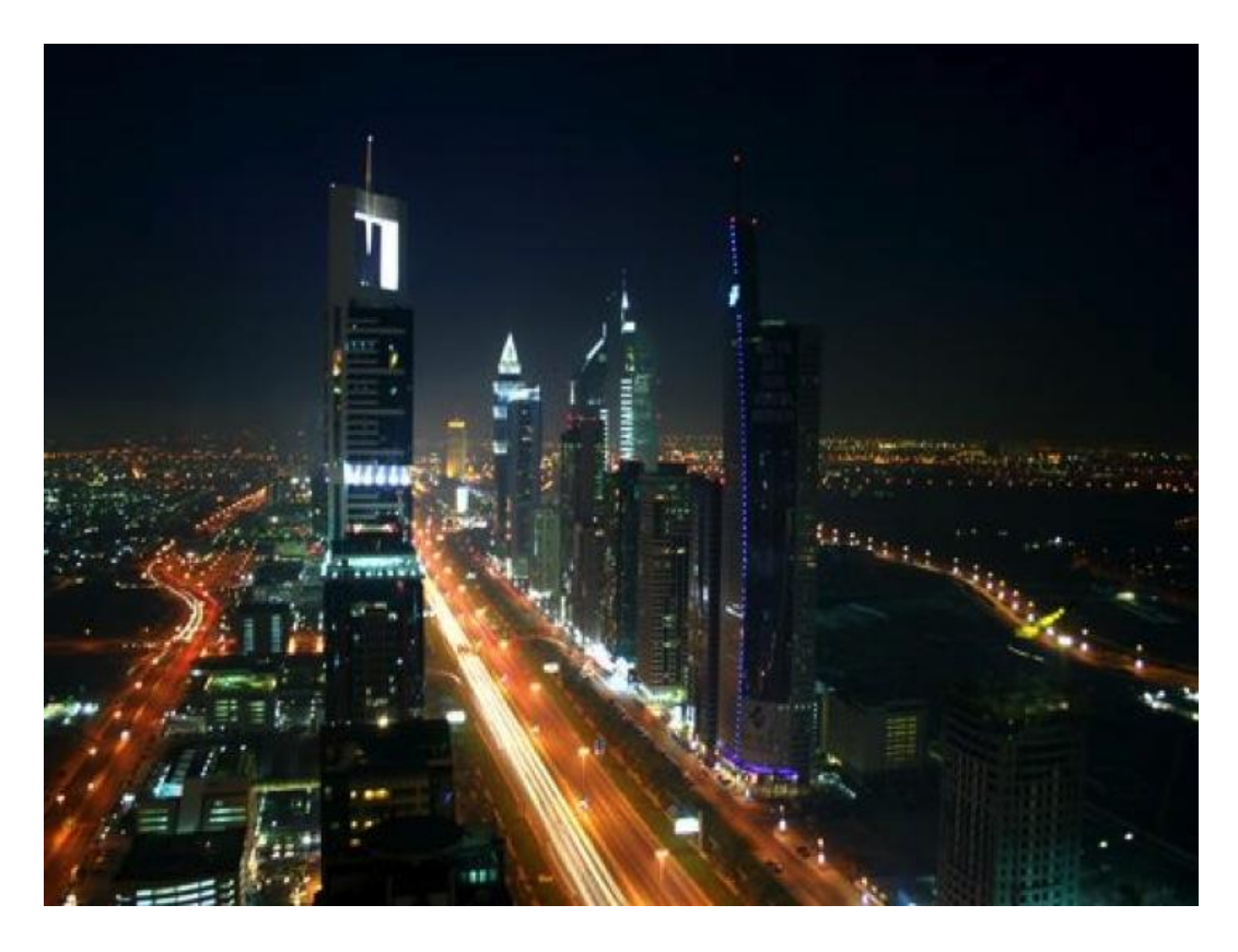
Figure 1: Stylized high-rises rise and shine on Sheik Zayed Road, Dubai's ultra-wide, ultra-long High Street. Unlike Manhattan, there is little if any functional or bulk zoning and the towers – many over 70 stories - neither taper with height nor space themselves for daylight and air. In this photo, nestling up to the skyscraper wall on the right is a low-rise subdivision of condos and villas on cul-de-sacs.