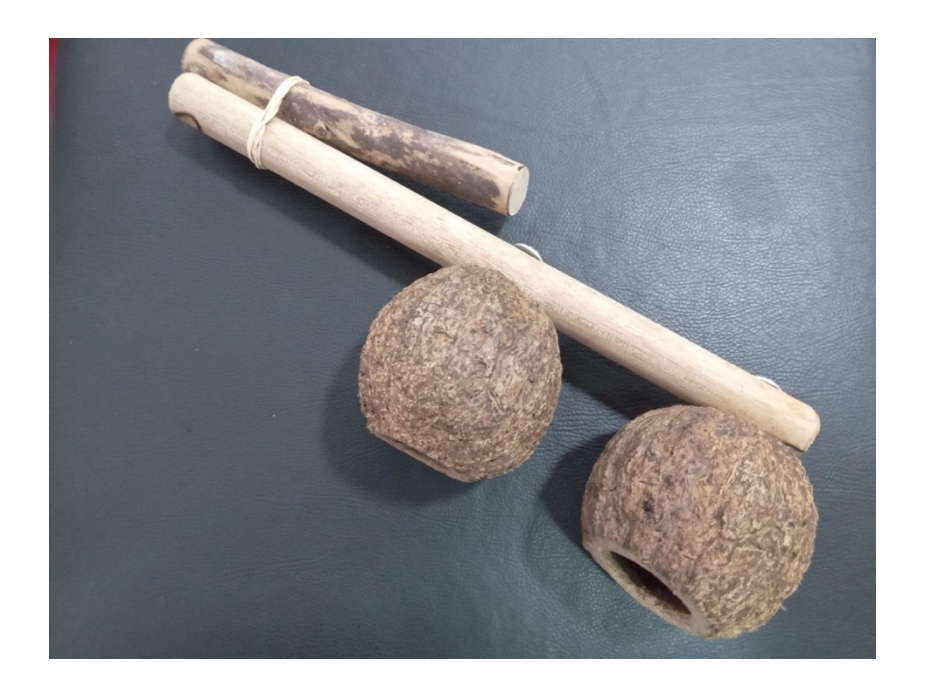
Figure 5: The agogô.