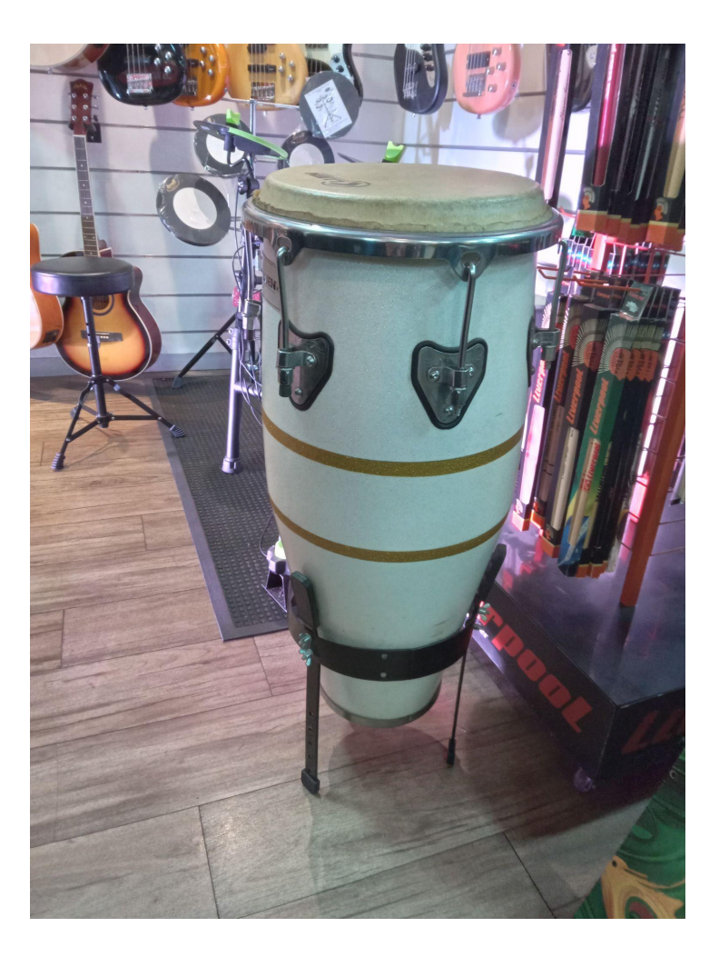
Figure 6: The atabaque.