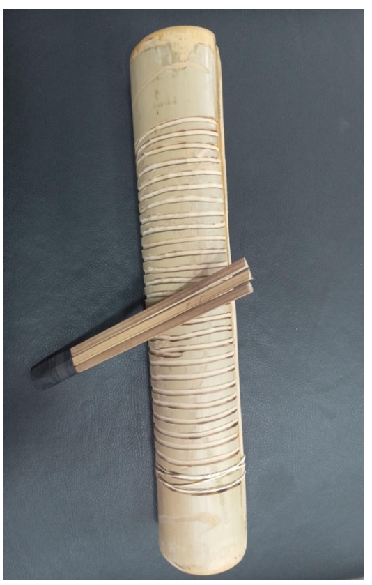
Figure 4: The reco-reco.