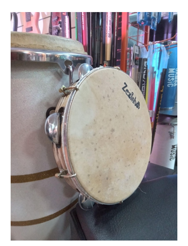
Figure 3: The pandeiro.