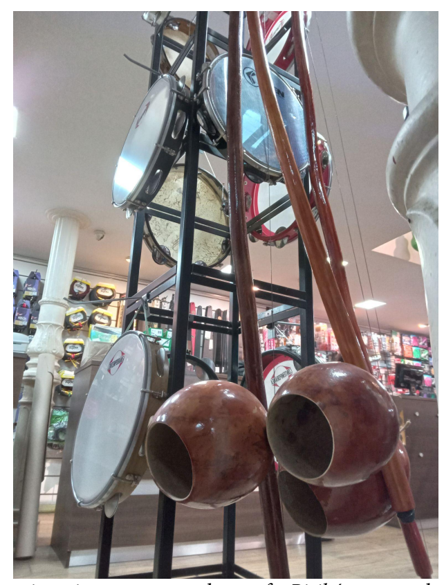
Figure 1: The berimbau is an instrument made up of a Biribá tree wood pole, a single steel wire, and a gourd. It is played with a stick, stone, and caxixi .<sup>7</sup>

As spring and summer arrive, when people are finally able to spend more time outdoors, fairs and events take place across Germany. The spas and parks are crowded with people in varying degrees of nudity, thirsty to enjoy days that dawn at five in the morning and only lose sunlight around ten. At the Englischer Garten, located by the river Iza in Munich – also where one of the most world-renowned German breweries is located – multicultural performances often take place. I remember feeling immensely happy and curious one afternoon in this park when, in the distance, I suddenly heard the sound of the berimbau and spotted a crowd coming together to see and hear a roda.