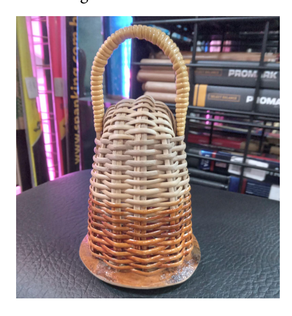
Figure 2: The caxixi is a percussion instrument filled with seeds, sounded by shaking, and played alongside the berimbau.

In the Congo region, where the country of Angola is located today, African musicians created multiple ways of extracting, from a single string, an infinity of sounds with instruments like the berimbau. According to author Tobias Gross, each player develops their art of playing according to their understanding and expectation of sounds, finding in elements of their own culture the solutions for making music.