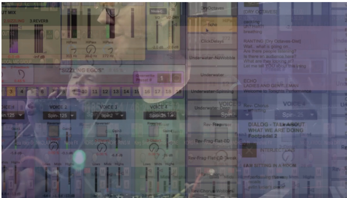
Video 3: “On Technology, Music Research, and Media,” a video clip from Fake Radiolab “Live from Park City,” July 5, 2023 (VU Symposium, Utah). 4

Now, in July, 2023, we are sharing this work at an inauspicious time. As war rages in Europe, NPR shows and related podcasts are capable of reproducing ideology with potentially catastrophic consequences. We are thankful to Current