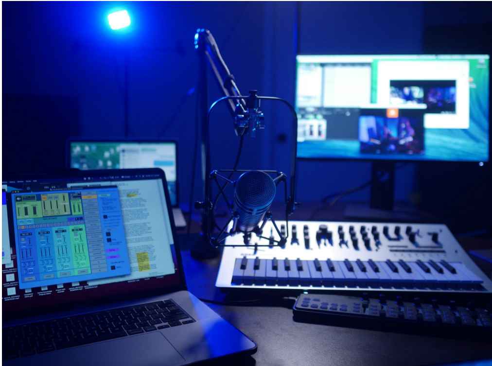
Figure 6: Adam's setup in Atlanta for "We've Been Canceled!" for Emory CompFest 2021/ Experimental Sound Studio "Quarantine Concert" series.