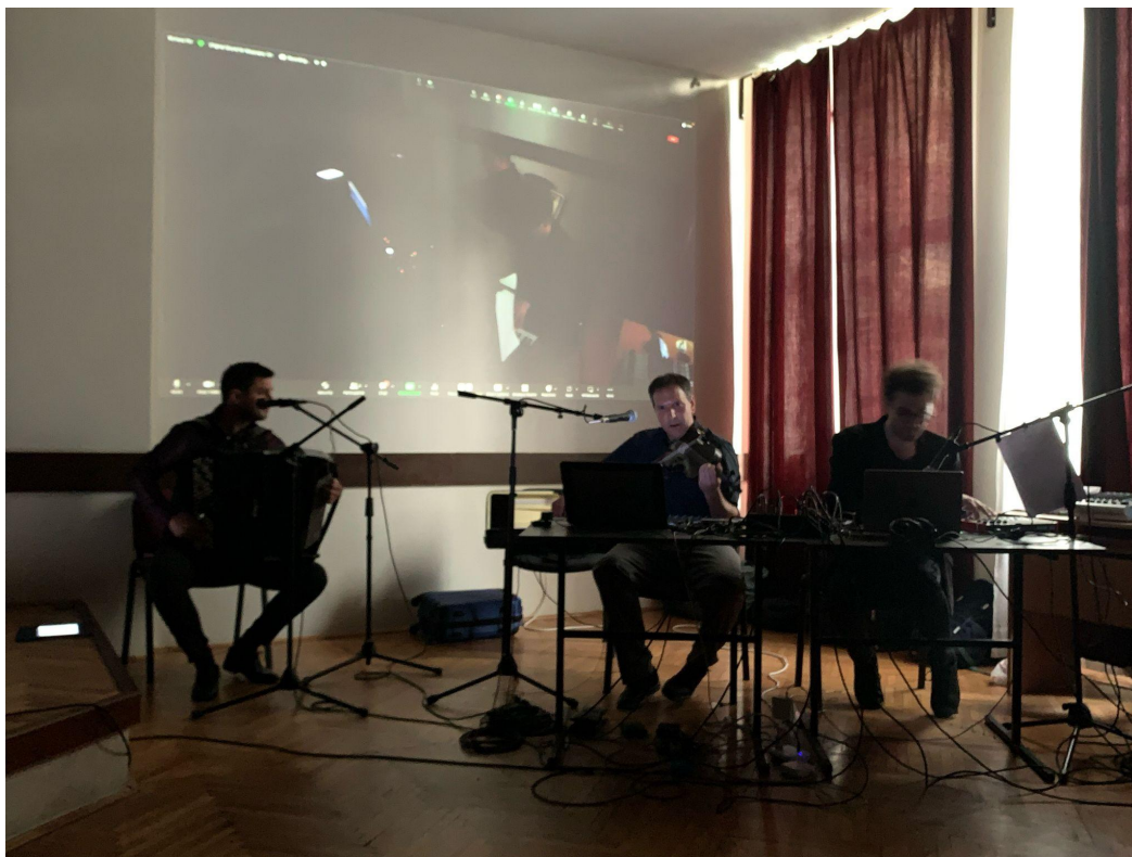
Figure 7: Fake Radiolab "Episode 9," Live from Belgrade, May 2023.