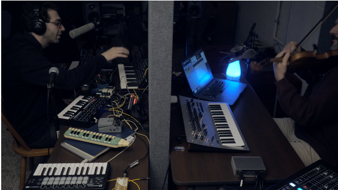
Video 5: Recording “Late Nite Jamout 2” in Atlanta, with guest vocalist Rimona Afana (out of frame), December 2020. 9

This arrangement also propelled our dive into performative punditry. For our discussion segments it triggered some of the antagonism (and class antagonism) inherent in social distance pageantry. 10