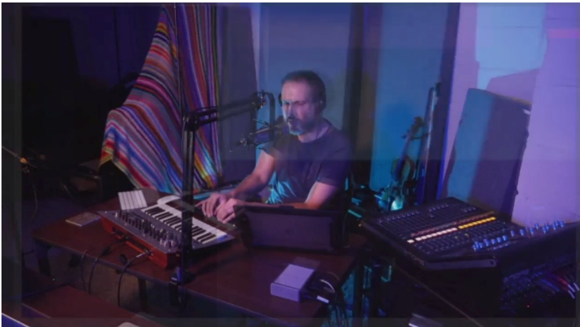
Video 1: "We Are Sitting In a Laptop," clip from We've Been Canceled! , Live-Remote Telematic Performance of Fake Radiolab , 2020. 2

Alvin Lucier's "I Am Sitting in A Room" focused on spoken word mediated by a feedback system of digital processing. We transposed visual components we developed for virtual concerts as live-projections for in-person concerts. We set up USB webcams that display what's going on with our hands/instruments, and we mix in overlays of screens from both of our computers, including Max patches and our digital audio workstations. In conjunction with these projections, we narrate our signal flow to expose our manipulations and the processes we implement.