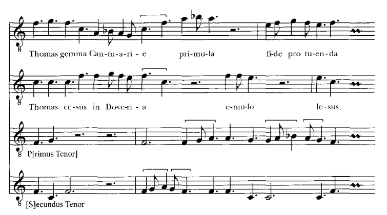
Example 2: GB-Ob20, f. 35; GB-Cgc512, f. 254; US-PRU, Garrett 119, ff. 4a, 3b, 2a, 5b. Early Church Music 14 (61).

It was this particular aural disposition, which caused English composers of the later fourteenth and early fifteenth centuries to engage in their extravagant manipulations of the cantus firmus (in the middle voice, migrant, and in various transpositions<sup>23</sup>), that proves their lack of concern for the perceptions and conceptions mandated by Dahlhaus. Analogously, when after the appearance of the contratenor bassus Tinctoris, a superbly intelligent and informed observer, in his Diffinitorium (1475) defined the tenor, i.e. of a cantus-firmus setting, as the referential basis or referential mainstay ( fundamentum relationis ) of a composition, he certainly did not say or mean to imply that it also necessarily had the function of a fundamentum concentus .