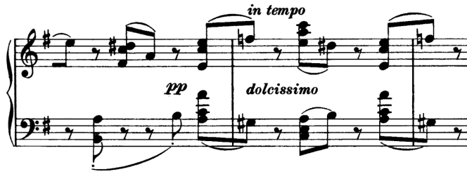
Example 2: Johannes Brahms, Intermezzo Op. 116, No. 5, mm. 28–30.