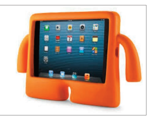
Figure 1. Tubby the Tablet.

First, at age 3, every child receives a gift from the U.S. Department of Education: a solid, virtually unbreakable, touchscreen computer tablet named Tubby, which (see Figure 1) can be thrown with impunity from a highchair or into the bath, with no adverse results to either the device or to the child (from the parent). The rationale is