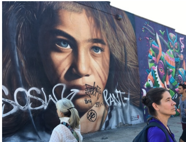
Bushwick Collective, 2016

5Pointz and Bushwick are exemplars of the deep cultural contradictions inherent in street art in general and well-crafted graffiti in particular. Until recently, graffiti, by tradition, was virtually always painted over. An underlying assumption was that it should not be permanent. Its temporary nature was a deeply engrained element of its aesthetic. Writing graffiti was an act of rebellion, a rejection of the fetishizing of “great” art, and a celebration of the sometimes hasty, impermanent, but joyful act of creation. Since much of it was illegal and its creation entailed risk, the expectation