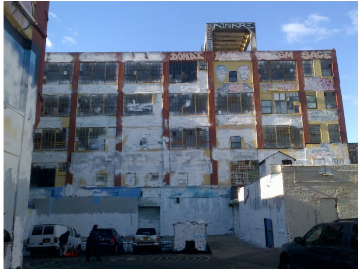
Appearance of 5Pointz after the whitewashing during the night of November 19, 2013