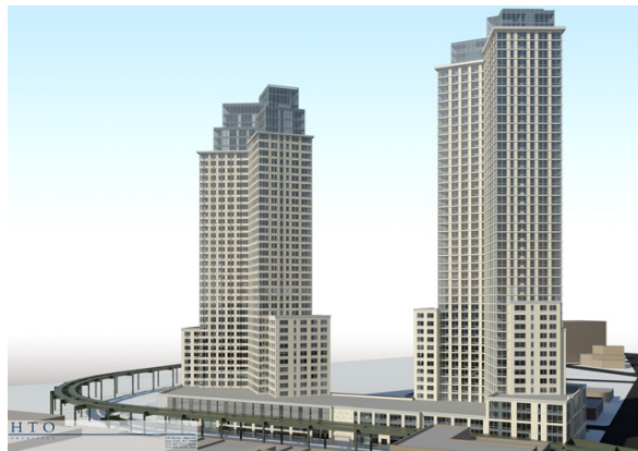
Rendering of the new apartment buildings, named 5Pointz after the graffiti site

After the demolition of 5Pointz in 2014, some of the evicted artists migrated to the Bushwick neighborhood of Brooklyn to join others already painting there. 13 Bushwick is a prime, present day example of the growing importance of graffiti as a widely recognized art form. 14 Its emergence as another internationally known graffiti zone is fascinating for both its aesthetic and legal implications. A variety of illegal street art proliferated in the area in the decades before and after the turn of the twenty-first century. It was not always a safe place to be. The Ficalora family has lived in the area for many years. Joseph Ficalora's father was killed during a 1991 robbery in the neighborhood. His family, owners of a steel fabrication business, remained in Bushwick, although that became more difficult for Joseph after his mother was diagnosed with brain cancer in 2008 and died in 2011. His efforts to eradicate graffiti around his business were constantly foiled. In 2013, during a period of deep frustration and depression, he began searching for information about street artists working in the area, hoping to find a way to alter the impact of their presence on the neighborhood. 15 The search changed his life. He developed friendships with