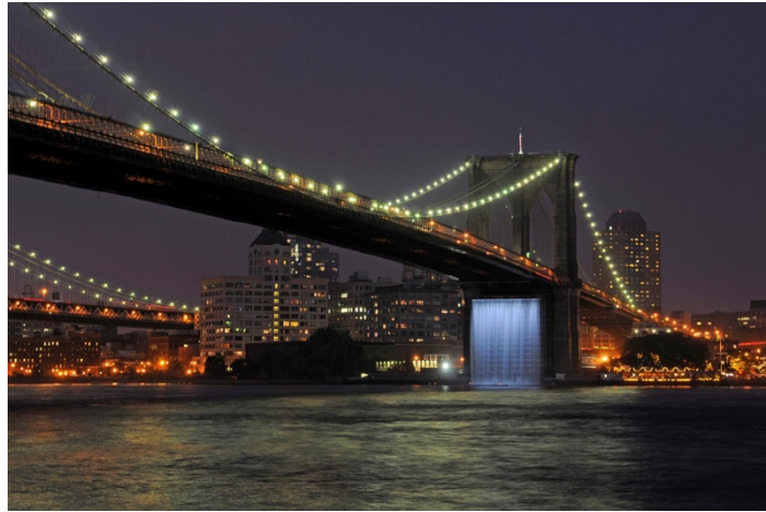
"The New York City Waterfalls, Brooklyn Bridge," 2008

failed to convince the city to condemn the land or the installation, or preserved their work in digital images. And even digital imagery, the closest to actual preservation among Judge Block's suggestions, hardly compares in quality to an actual work of art or to the setting in which it is located.