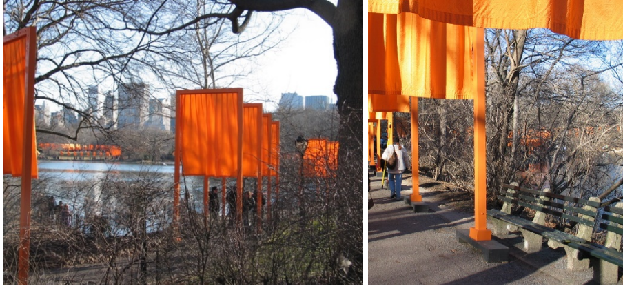
"The Gates," 2005

Temporary urban art installations are now common, often revealing surprise and artistic talent to those living, working, and walking through cities and towns around the world. 65 Sculptural works are regularly on display in various neighborhoods throughout New York City. One of the most interesting was a series of four thirty to forty meter-high temporary waterfalls constructed in 2008 by Olafur Eliasson, under the auspices of the Public Art Fund, at points along the East River and New York harbor. 66 They operated only between July and October 2008. An image of the installation under the Brooklyn Bridge is below. 67 If someone announced a plan to move or to bulldoze a row of Christo's gates or to pull down one of Eliasson's waterfalls at night, it is hard to imagine that a court would deny the artist an injunction under VARA. 68 It would (or should) make no difference that Christo or Eliasson could have obtained monetary damages to compensate them if their works were destroyed, or sought but failed to obtain landmark status for the installation, or