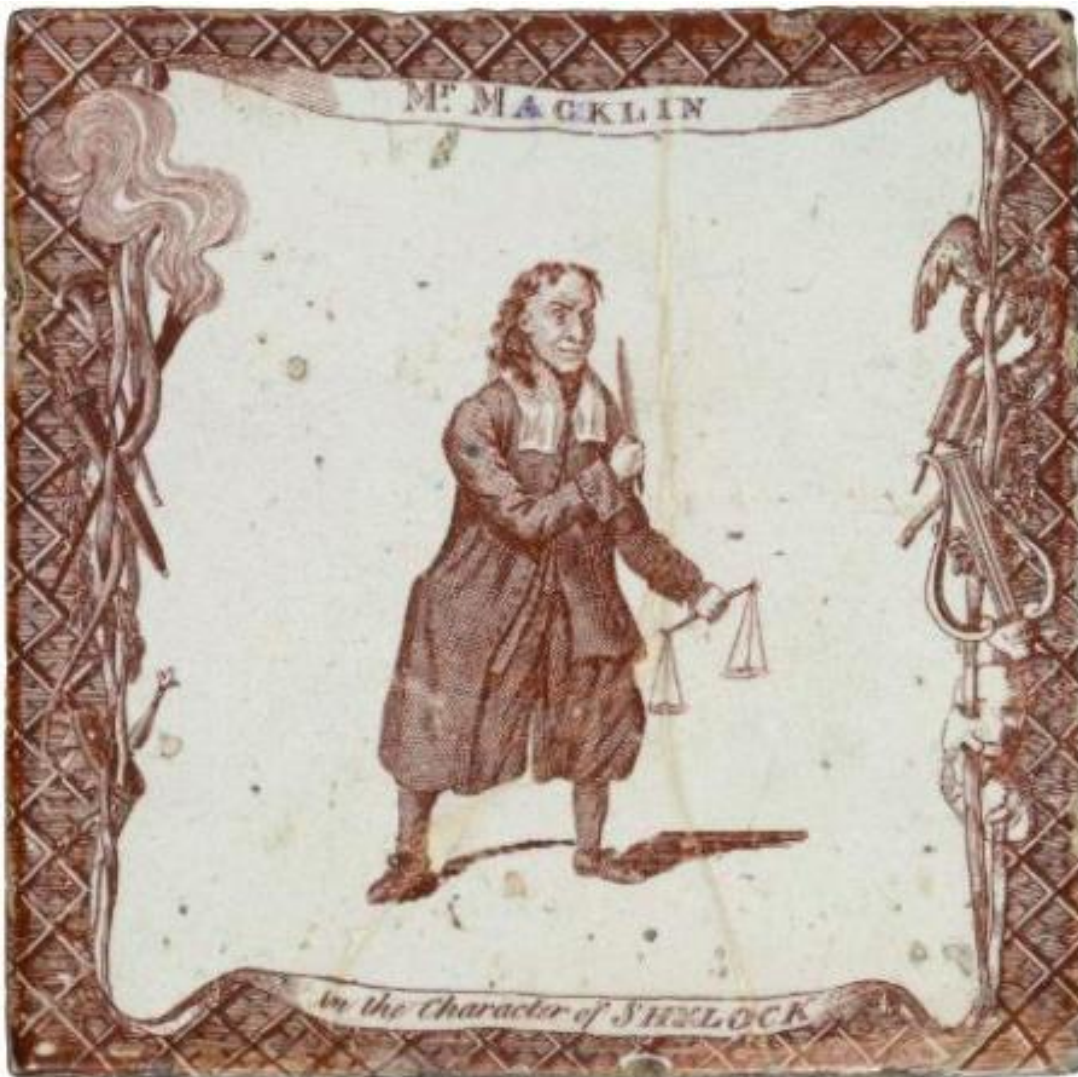
Figure 2: Charles Macklin as Shylock, ca. 1777-1780, from: “[Charles Macklin as Shylock] [realia].”.