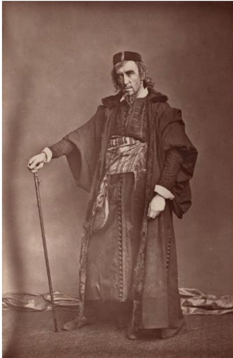
Figure 4: Henry Irving as Shylock, ca. 1879, from: Sawyer, Edward Lyddell. "Sir Henry Irving as Shylock in 'The Merchant of Venice!'" National Portrait Gallery , https://www.npg.org.uk/collections/search/portrait/mw88740/Sir-Henry-Irving-as-Shylock-in-The-Merchant-of-Venice .