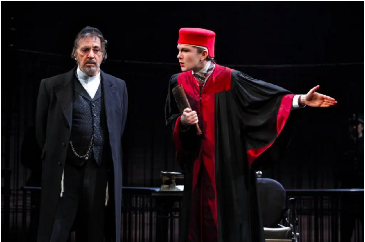
Figure 13: Al Pacino dressed all in black to emphasize Lily Rabe's red Portia costume, from: Brantley, Ben. "Love and Dirty, Sexy Ducats." The New York Times , A.G. Sulzberger, 13 Nov. 2010, www.nytimes.com/2010/11/14/theater/reviews/14merchant.html .