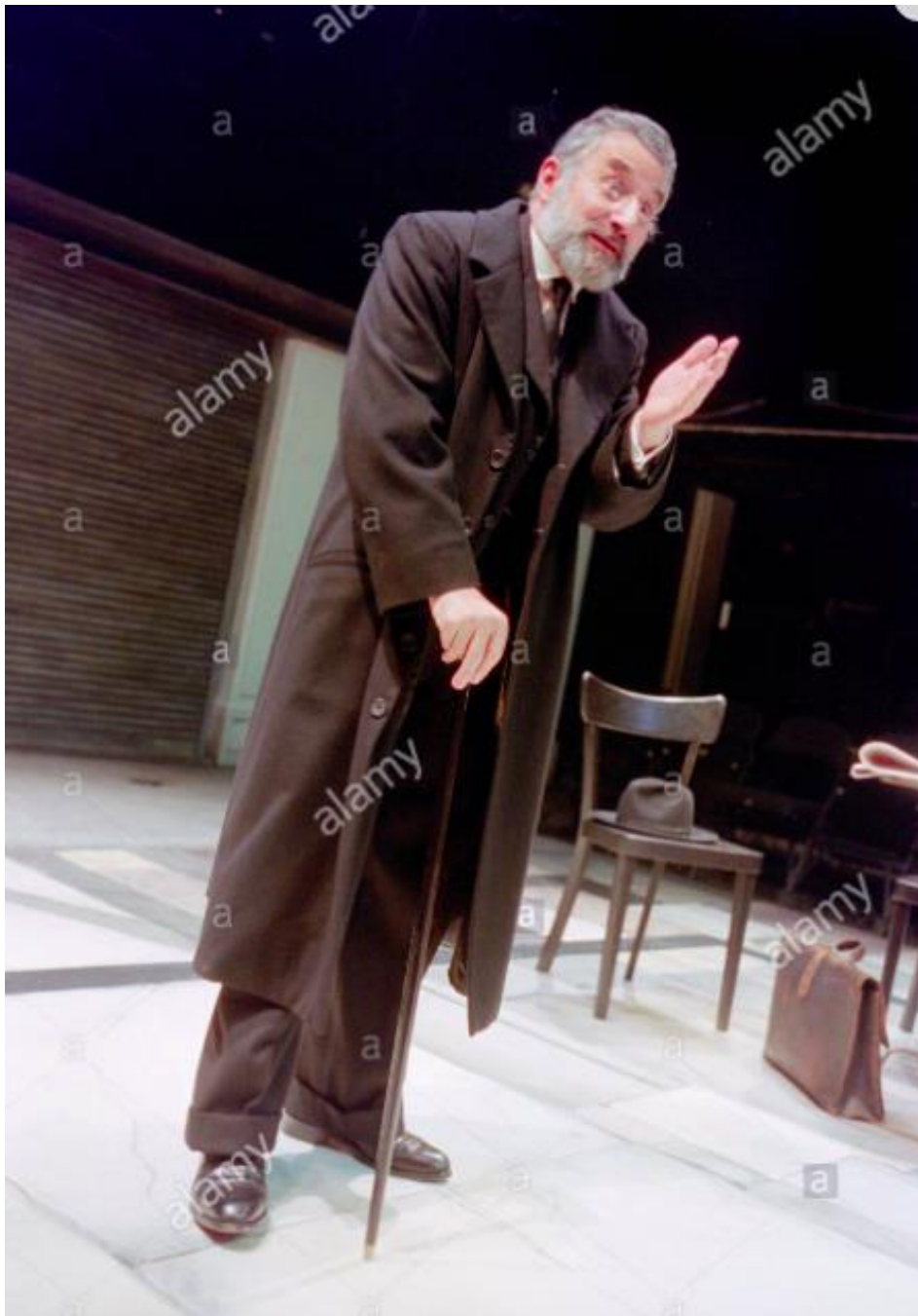
Figure 11: Henry Goodman as Shylock ca. 1999