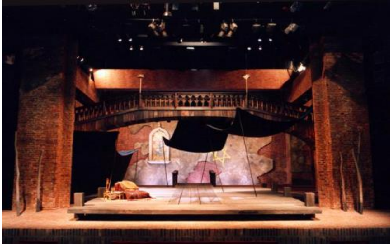
Figure 9: Kit Surrey's set design for the 1987 RSC production starring Antony Sher bears a graffitied image of the yellow star of David, from: Joe Cocks Studio Collection, "Bill Alexander 1987 Production." Royal Shakespeare Company , Shakespeare Birthplace Trust, https://www.rsc.org.uk/the-merchant-of-venice/past-productions/bill-alexander-1987-production .