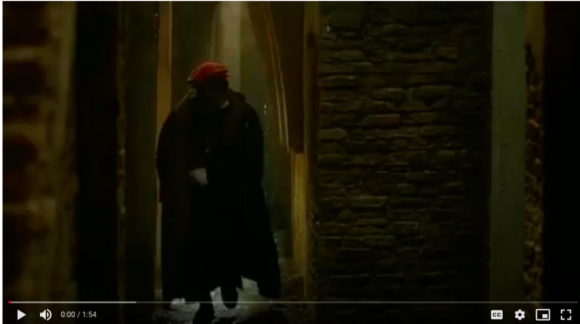
Figure 12: Click this link to access film clip of Al Pacino as Shylock when he realizes that Jessica has abandoned him, from: The Merchant of Venice . Directed by Michael Radford, 2004.