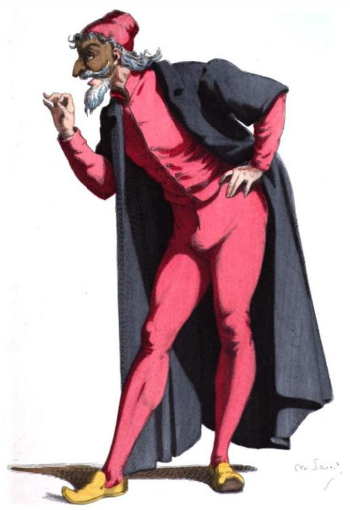
Figure 1: Illustration of Don Pantalone, 1550, reprinted from the Memoirs of Carlo Gozzi vol. 2, 1797, from: “Commedia dell’Arte Pantalone.” The Museum of Cultural Masks: Second Face, Second Face , 2018, https://www.maskmuseum.org/mask/commedia-pantalone/ .