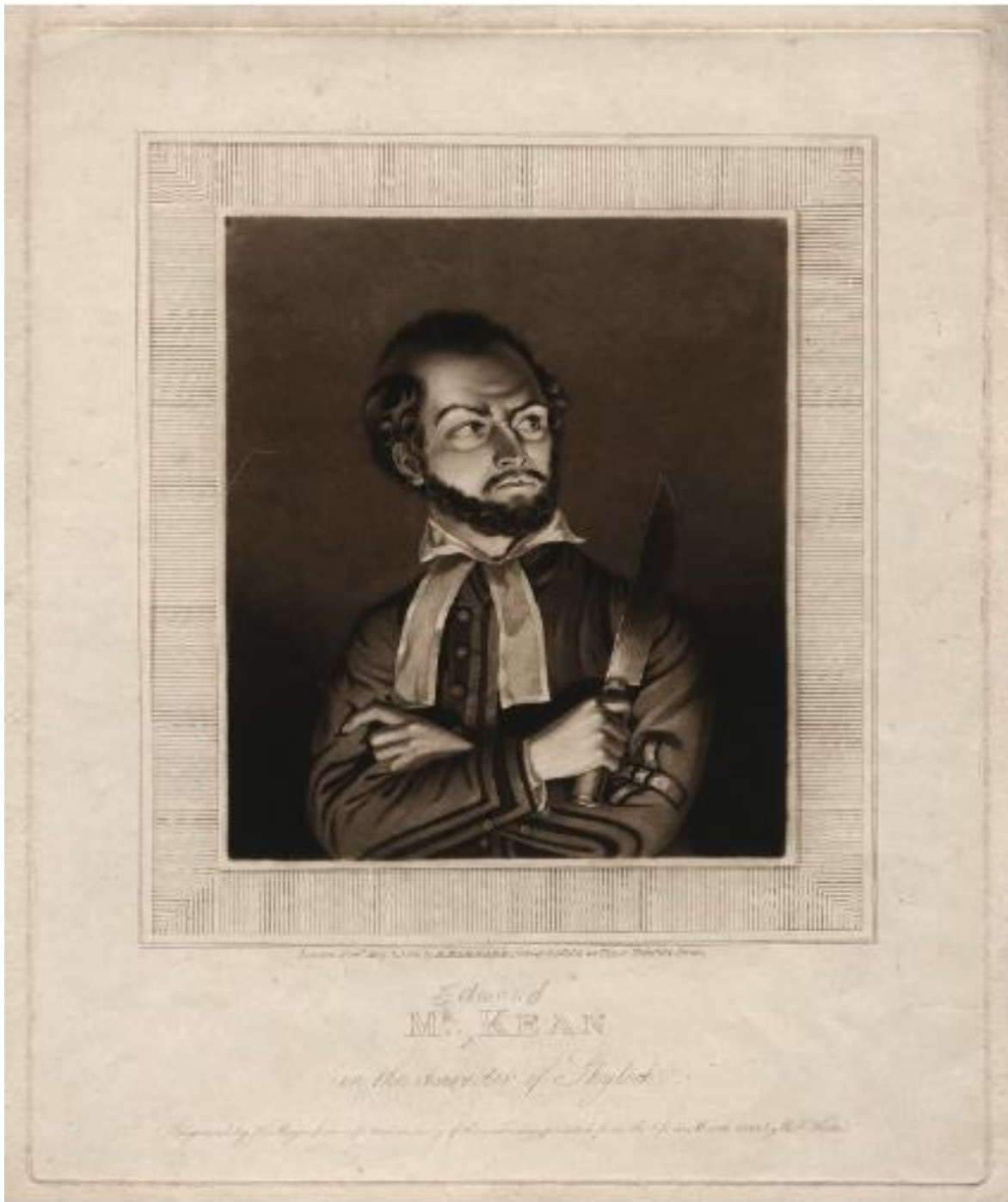
Figure 3: Edmund Kean as Shylock, ca. 1814, from: Barnard, R. et al. “Edmund Kean as Shylock.” National Portrait Gallery , https://www.npg.org.uk/collections/search/portrait/mw37677/Edmund-Kean-as-Shylock .