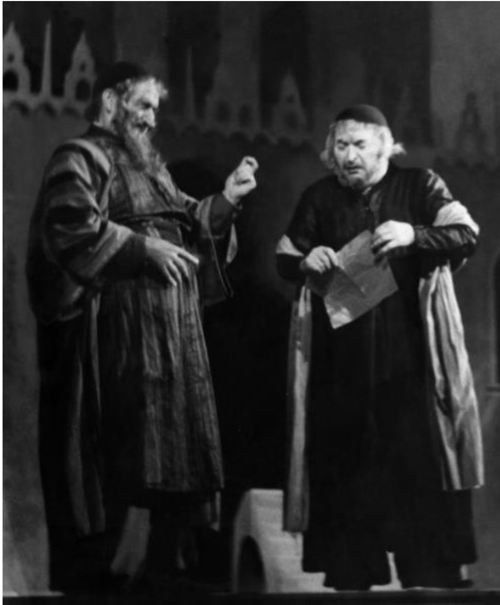
Figure 6: Werner Krauss, right, as Shylock at Vienna's Burgtheater , ca. 1943