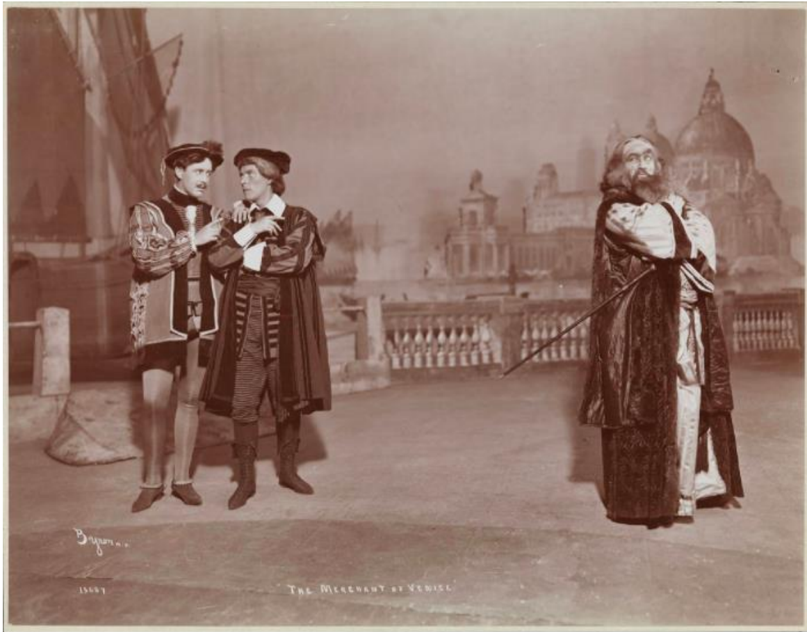
Figure 5: Jacob P. Adler, far right, as Shylock, ca. 1903, from: “Plays, ‘The Merchant of Venice.’” Museum of the City of New York , MNY, https://collections.mcny.org/CS.aspx?VP3=DamView&VBID=24UP1GRU3KAIZ&SMLS=1&RW=1440&RH=699 .